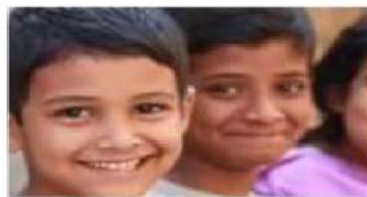
Women & Children Health Empowerment

help us to get better education or better future